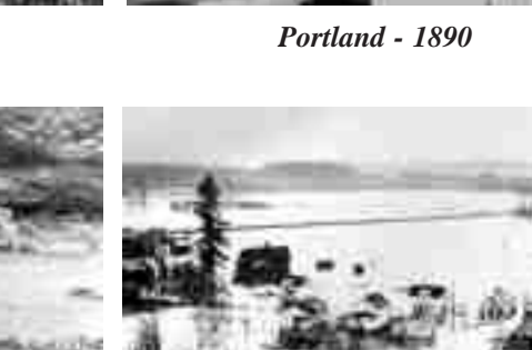
Willamette Falls - 1964