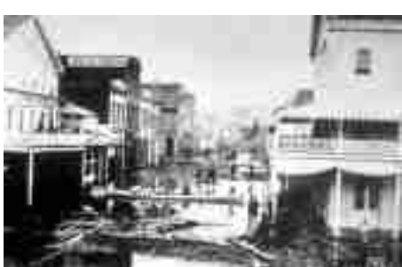
Portland - 1862

We assembled data on the extent of major historical floods from records provided by the Army Corps of Engineers and digitized by the U.S. Fish and Wildlife Service (Fig. 33). After the large floods of the late 1800s, which greatly exceeded floods of the 20th century, the Corps sent letters to communities along the river to identify high water marks, and they also surveyed particular areas in an attempt to identify the boundaries of inundation for the floods of 1861 and 1890. The Corps conducted a major flood study after the floods of 1943 and 1945, which carefully demarcated the boundaries of flooding. We combined flood extent maps for 1861, 1890, 1943, 1964, and 1996 to create a map of the historically inundated floodplains of the Willamette River from Portland to Eugene (Fig. 35).