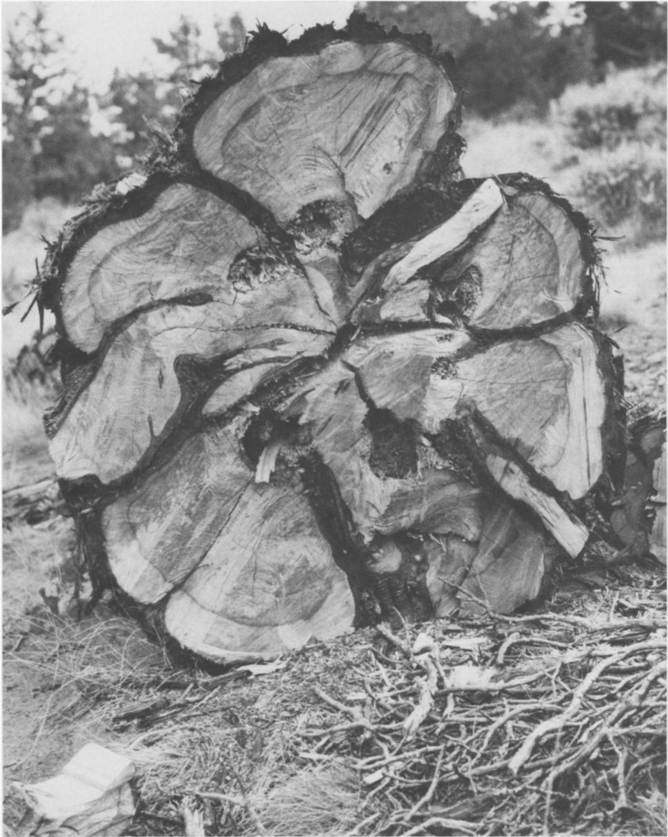
Fig. 1.—Base of the largest juniper harvested for this study (273 cm basal circumference, 8.5 m tall). Sapwood forms a lighter discontinuous band around the outer edge, and bark inclusions commonly penetrate near the center of the stem. At the base of this tree are four isolated pockets of rot

supporting foliage were clipped below the foliage clump to create a third group of small, live, foliage-bearing twigs. Live and dead branches and foliage-bearing twigs were weighed fresh in the field to the nearest 0.5 kg.