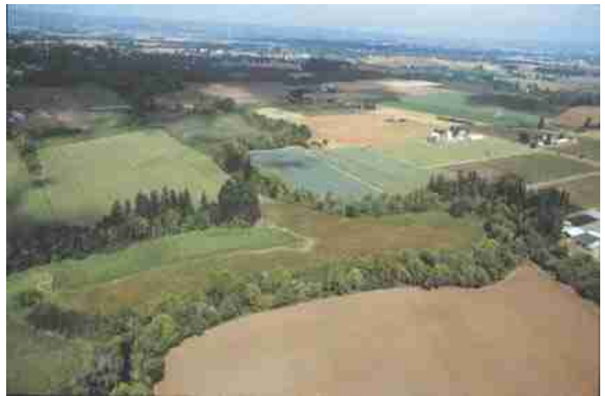
Figure 108. Riparian vegetation along small streams in agricultural land in the Willamette Valley.