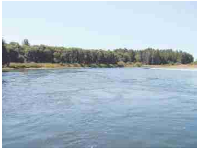
A mixture of willow and ash trees along the Willamette River, between Corvallis and Harrisburg.