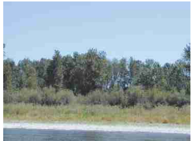
Recruitment of different age classes of cottonwood trees at Snagboat Bend, Willamette River.