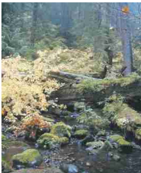
Riparian vegetation along Mack Creek in the Uplands of the WRB.