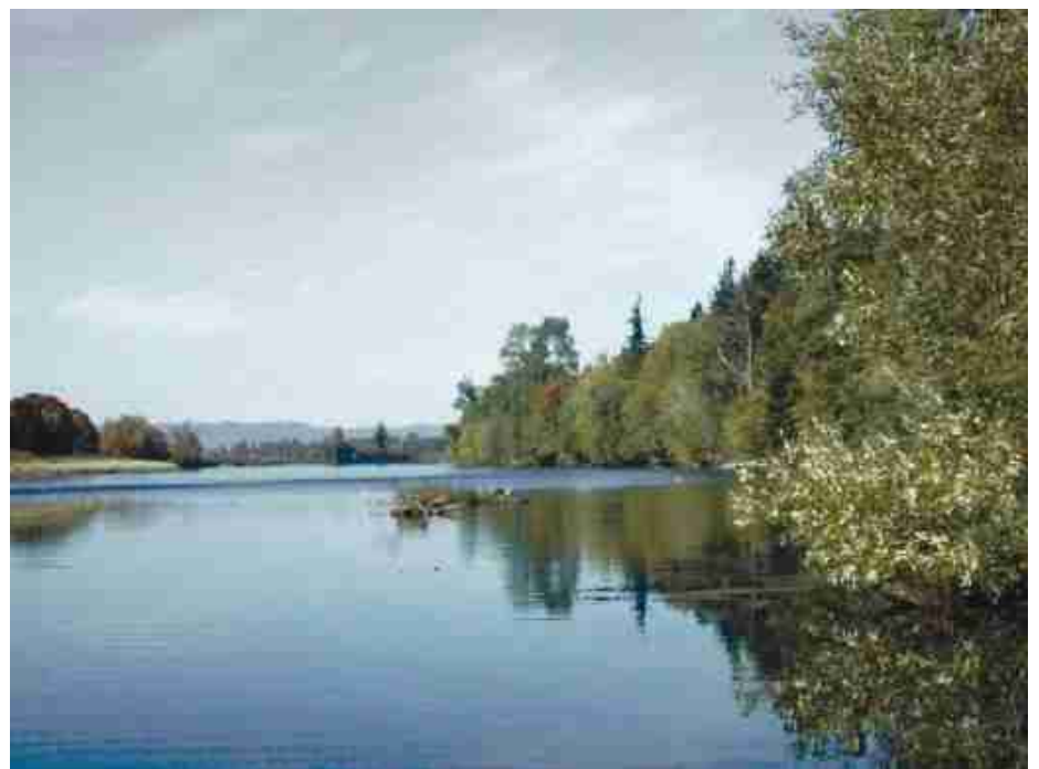
Figure 109. Willamette River riparian vegetation upriver from Corvallis. Additional examples are shown on facing page.