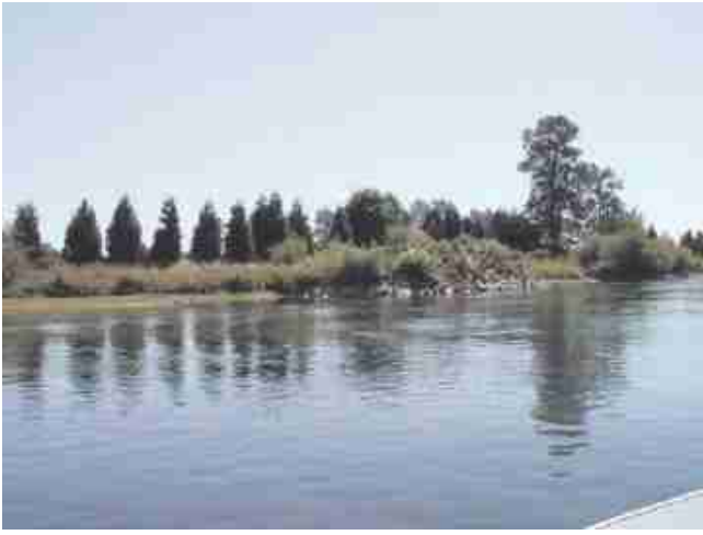
Cottonwoods and revetment along the Willamette River near Harrisburg.