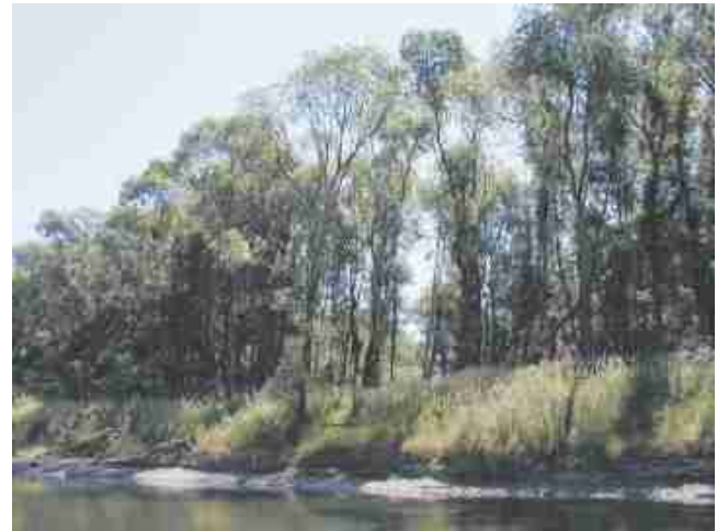
A mature stand of willows along the Willamette River.