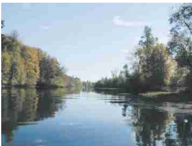
Mature riparian vegetation along an alcove of the Willamette River.