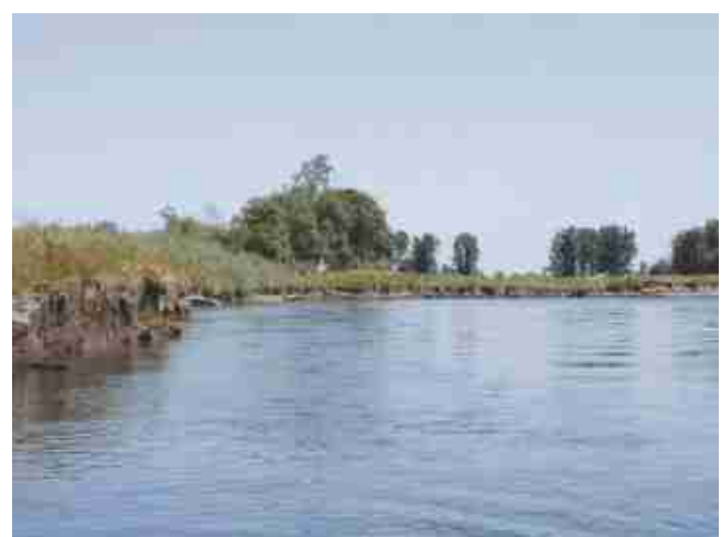
Bank erosion, loss of older cottonwoods with recruitment of young cottonwoods along the Willamette River.