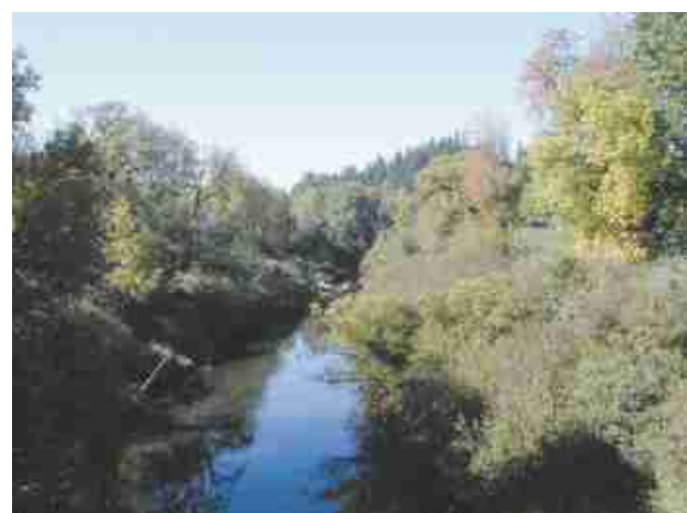
Riparian vegetation along the Luckiamute River in the Lowlands of the WRB.