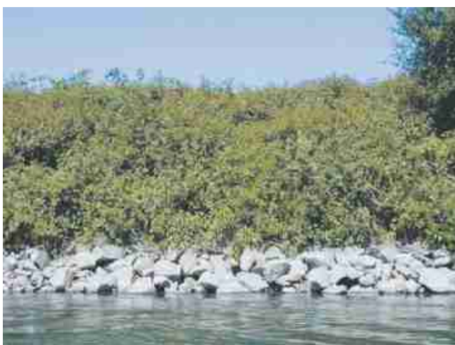
Himalayan Blackberry growing on revetment along Willamette River.