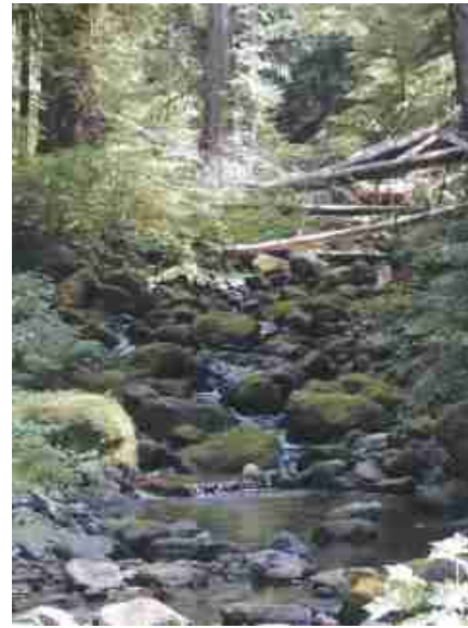
Riparian vegetation along a montane stream in the Uplands of the WRB.