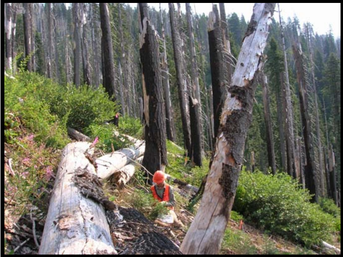
Figure 3. Nineteen years after wildfire consumed this white fir stand in the Klamath National Forest, trees were still relatively small (0.5-2 m) but numerous (>5,000/ha).