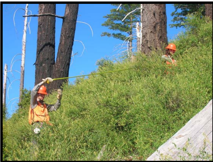
Figure 4. Laying out the 12x40 m transect through ceonothus beneath large snags left after the fire of 1987.