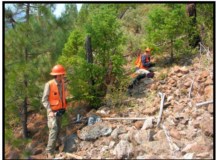
Figure 10. Scant vegetation on a south facing site with rocky soil indicative of 'harsh' conditions, conifers were making a come back after a wildfire in 1987.