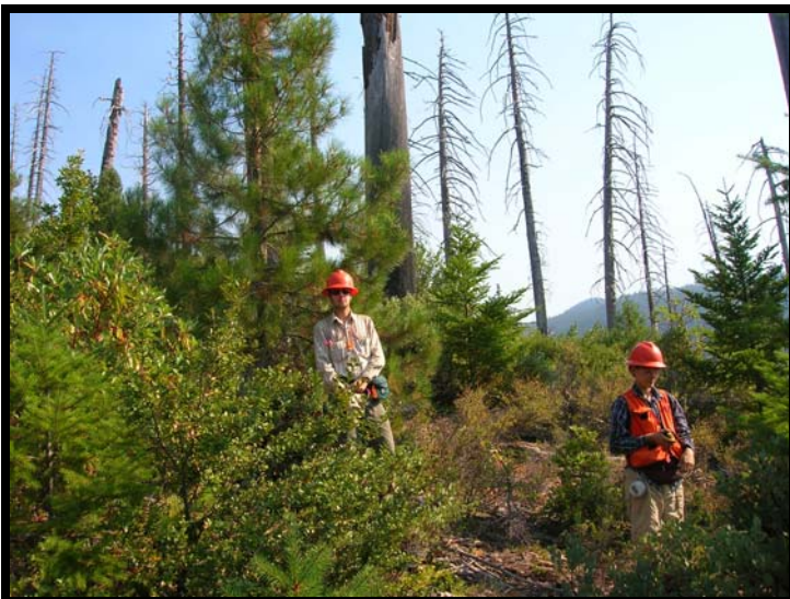
Figure 8. Knobcone pine and Douglas-fir saplings emerge above the manzanita in the Siskiyou Wilderness area burned 19 years previously.