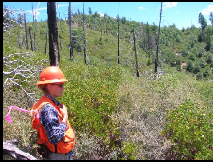
Figure 7. Across the Trinity river, on a south facing slope, manzanita and canyon-live oak were winning out over conifers.