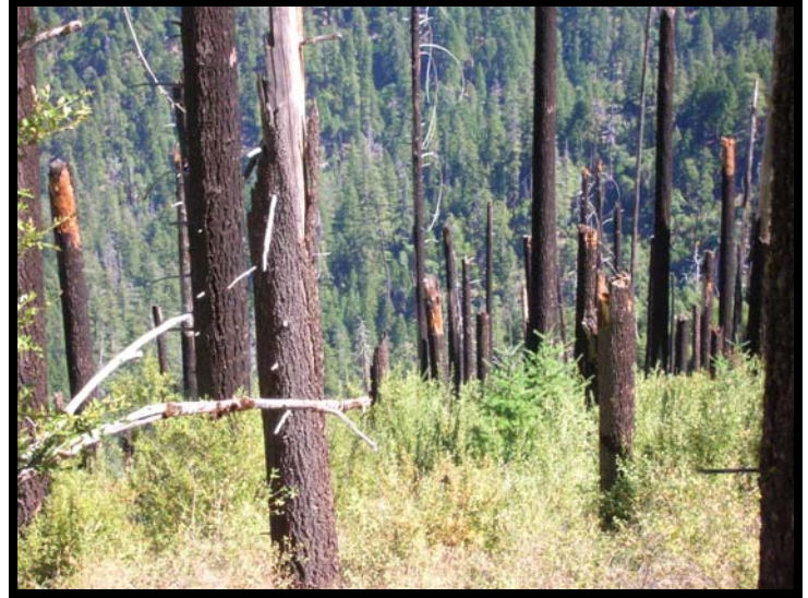
Figure 9. Blackened snags still standing 19 years after the Lake fire of 1987.