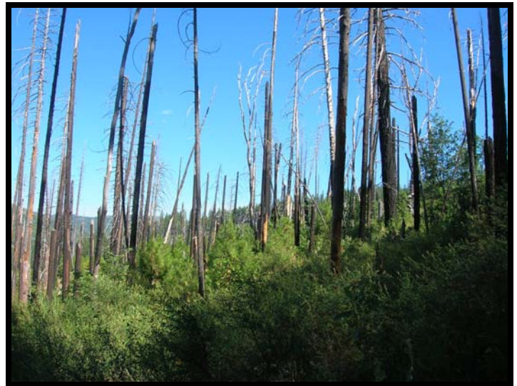
Figure 6. Salvage logging after the Hermit Fire in 1988 left a ¼ mile buffer on the SW Trinity River. The unsalvaged buffer (pictured here) provided a great opportunity to study natural regeneration ~20 years after fire.