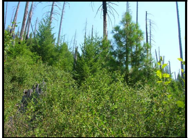
Figure 5. A young forest of Douglas-fir and Ponderosa pine growing vigorously along with the brush on the site of the Lake Fire of 1987, Klamath National Forest.